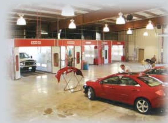
Downdraft Paint Curing Cabins