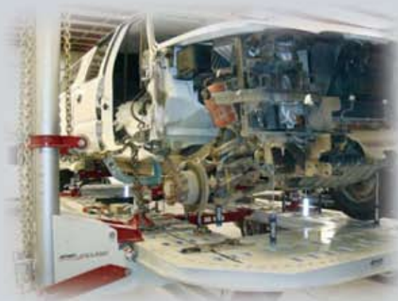
Lazer Frame Measuring Equipment